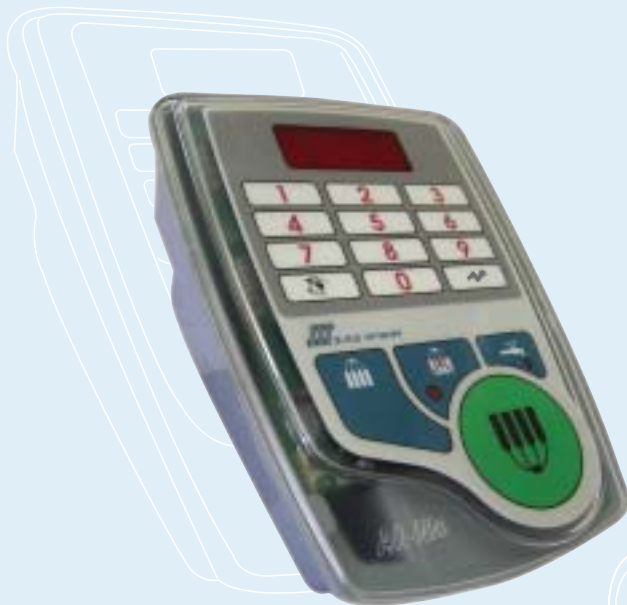
AfiLite Control Panel

An array of efficient, low cost vacuum/air operated vacuum shut off valves are also available.